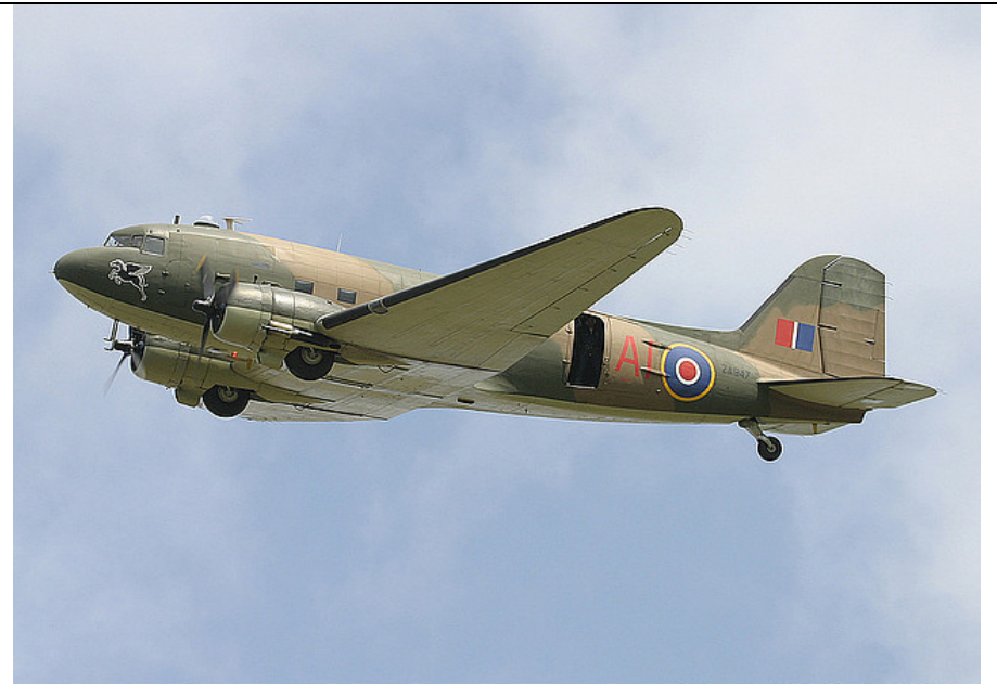
DC-3 Dakota C-47/Navigator/passenger