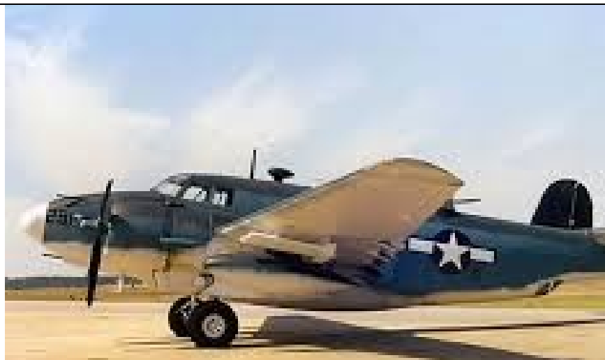
PV-1 Ventura PBN-1/navigator