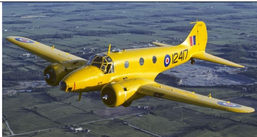
Avro Anson- Trainer